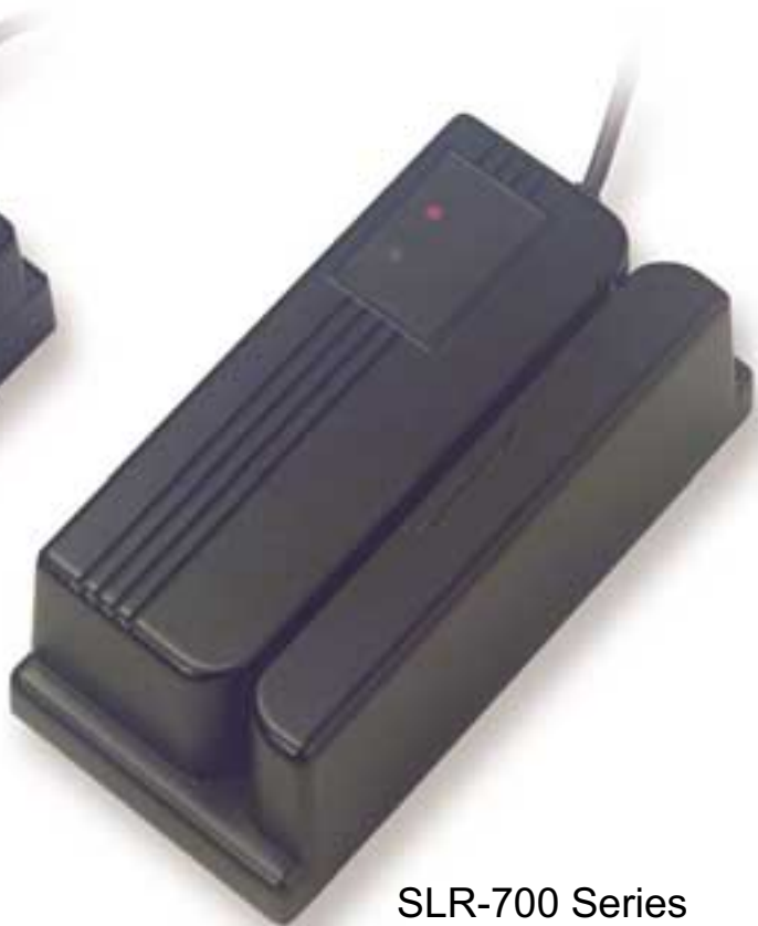
SLR-700 Series Metal Housing

The Barcode Slot Readers are designed to provide excellent scanning performance on a wide variety of barcode cards, badges, tags or printed forms.