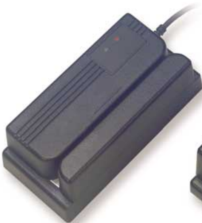
SLR-70 Series Plastic Housing